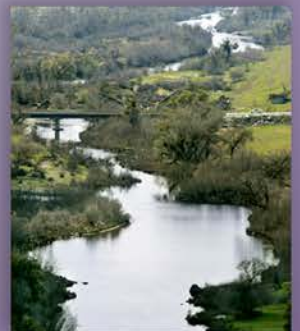
San Joaquin River