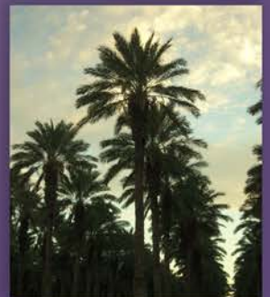
Colorado River Basin