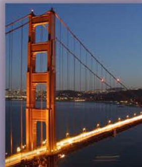
San Francisco Bay Area