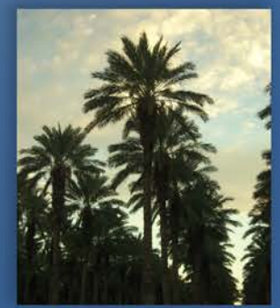
Colorado River Basin

The Natural Resources Agency. Department of Water Resources. Division of Integrated Regional Water Management