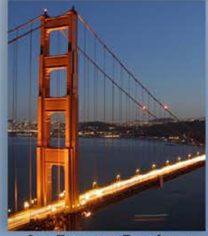
San Francisco Bay Area