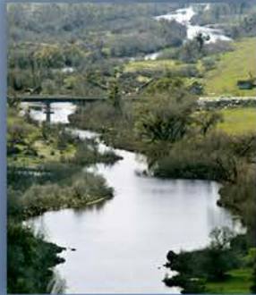
San Joaquin River