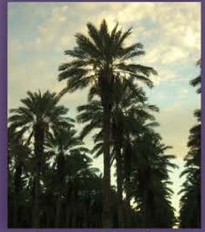
Colorado River Basin