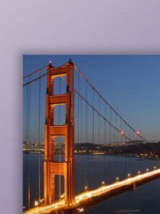
San Francisco Bay Area