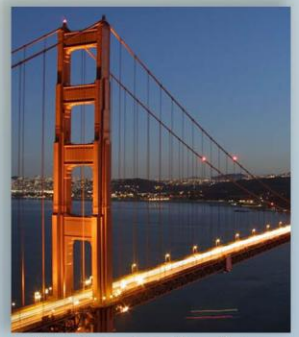
San Francisco Bay Area