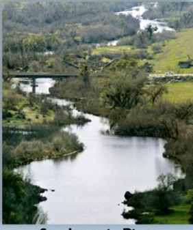
San Joaquin River