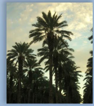
Colorado River Basin

The Natural Resources Agency . Department of Water Resources . Division of Integrated Regional Water Management